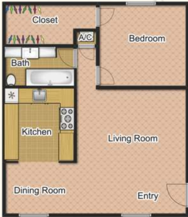
1 Bdrm / 1 Bath 769 Sq. FT.*