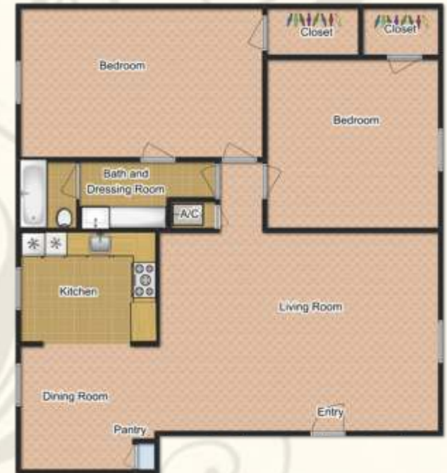
2 Bdrm / 1 Bath 1,109 Sq. Ft.*